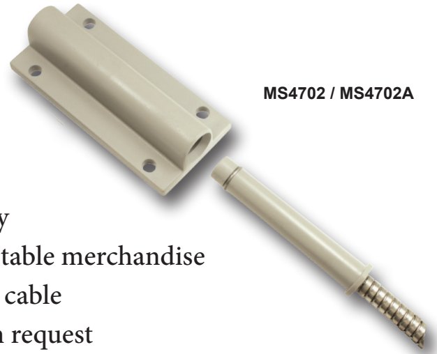
MS4702 / MS4702A