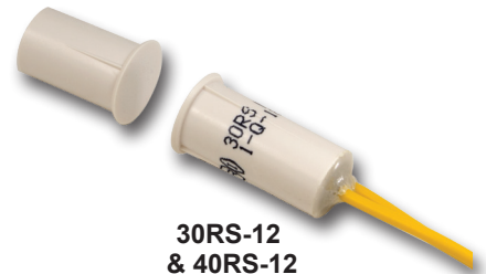
30RS-12 & 40RS-12 .780