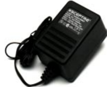
2935T Regulated Power Supply +5V @ 700 mA