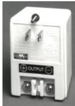
8065 AC/DC Adaptor Regulated 12V DC 500 mA U.L. Listed Screw Terminal Connections