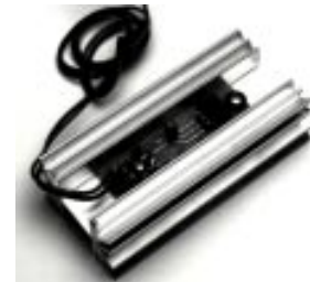
2930 Regulated 12V - 5V DC-DC Converter @350 mA Output

Designed to accommodate the new lower power consumption electronics the GRI DC to DC regulated power supplies, will maintain a set +5V DC output at 350 mA from a 12 V DC supply in the model 2930 or from a 24V DC supply in the model 2933.