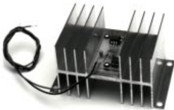
2933 Regulated 24V - 5V DC Converter @350 mA Output