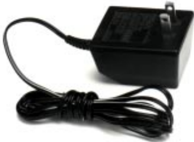
6973 Non-regulated Plug-In Power Supply 9VDC 50 mA Output U.L. Listed E152985(S)