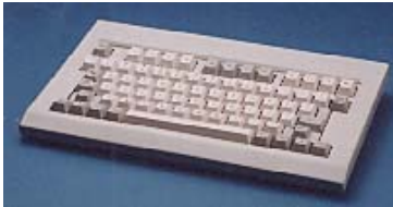
3075 ASCII, XT/AT Keyboard