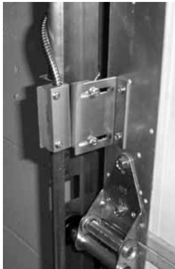
8297 Industrial Track Mount