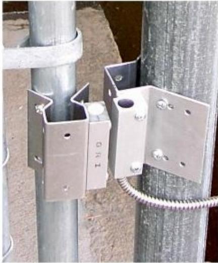
8450-3 Combination Post Mount