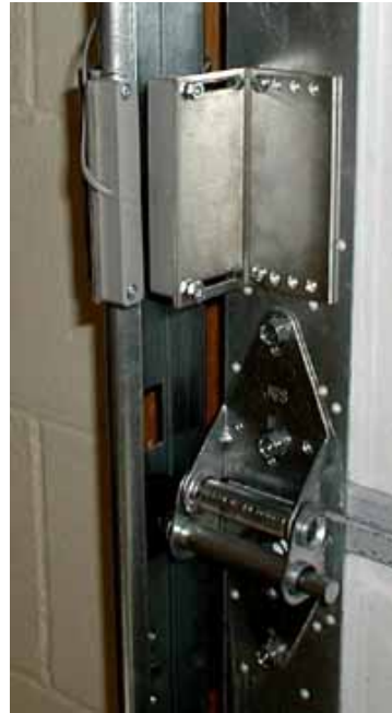
8299-G Economy Track Mount